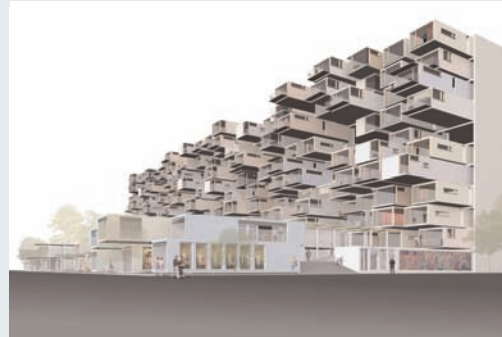
Eight Inc. Sawtooth Tower