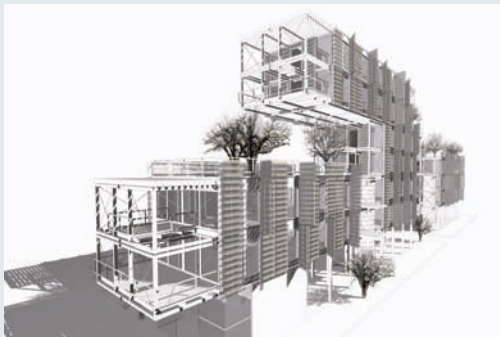
Anderson Anderson Architecture Camel Back Shot Gun Sponge Garden