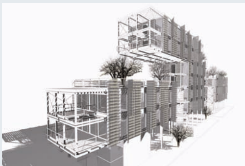
Anderson Anderson Architecture Camel Back Shot Gun Sponge Garden